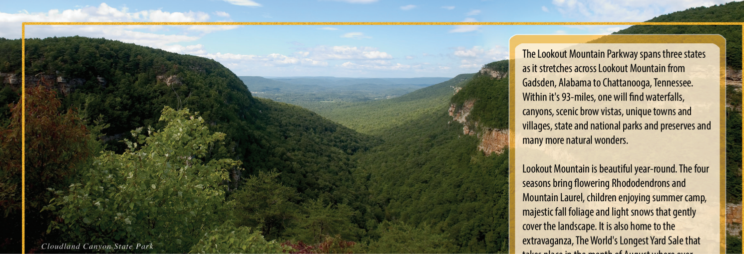
Cloudland Canyon State Park

The Lookout Mountain Parkway spans three states as it stretches across Lookout Mountain from Gadsden, Alabama to Chattanooga, Tennessee. Within it's 93-miles, one will find waterfalls, canyons, scenic brow vistas, unique towns and villages, state and national parks and preserves and many more natural wonders.